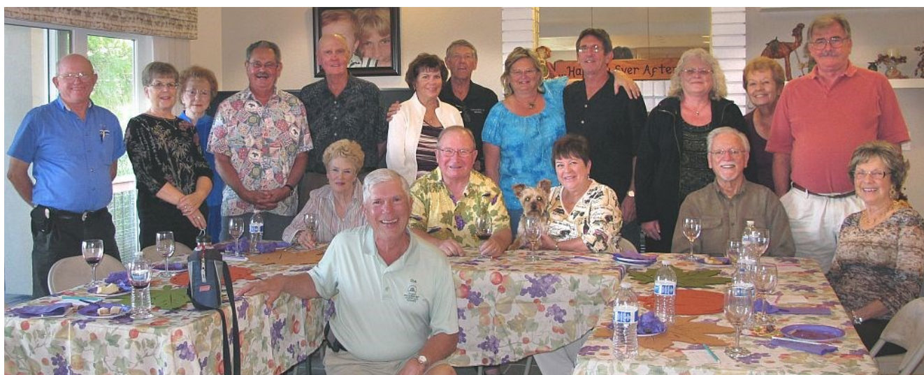
The Wine Tasting group at a recent event.

Come try pickleball on our new courts in Discovery Bay at Cornell Park on Willow Lake Road. Drop-in play schedule is now Tuesday, Thursday and Saturday at 8:00 am and Wednesday at 3:00 pm. So come join in the fun for a little exercise, competition and socializing. Just bring yourself; we have everything else.