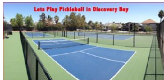
The new Pickleball courts in Discovery Bay.

The regular drop-in play is now Tuesday, Thursday and Saturday at 9:00 am and Wednesday at 3:00 pm. So come join in the fun for a little exercise, competition and socializing. Just bring yourself; we have everything else needed.