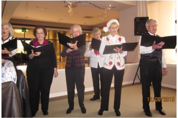
Entertainment provided by the Brentwood Singers.