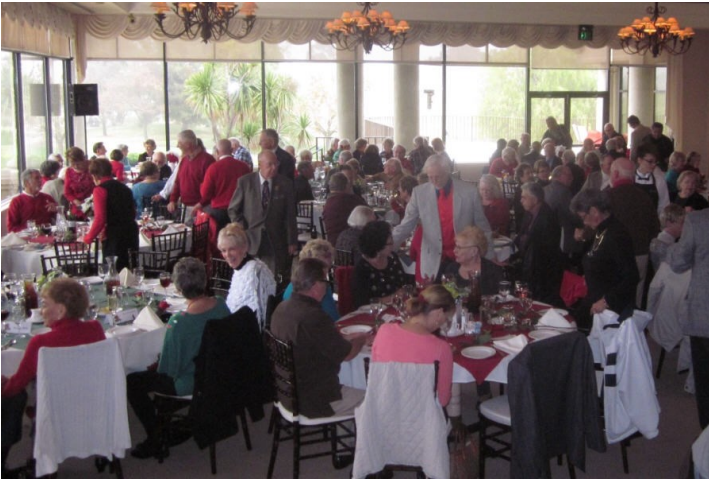
Our December Christmas luncheon with the ladies.