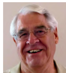
LaVan Bock email distribution