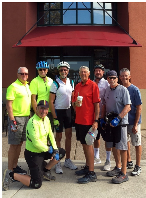
The SIR Cyclers' group continues to add new riders. Come join us for a fun way to exercise