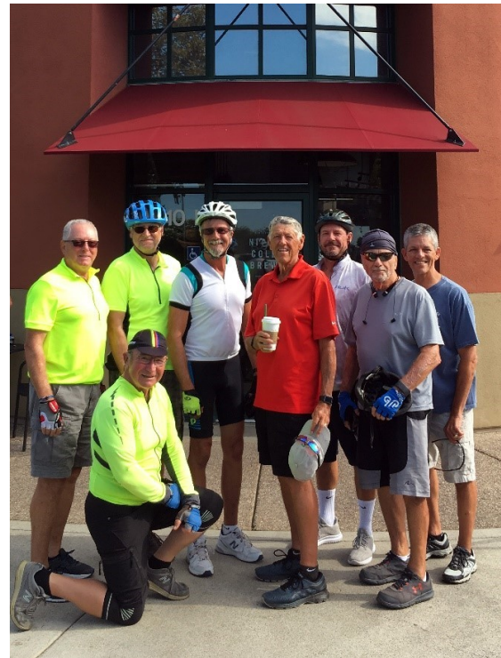
The SIR Cyclers' group continues to add new riders. Come join us for a fun way to exercise