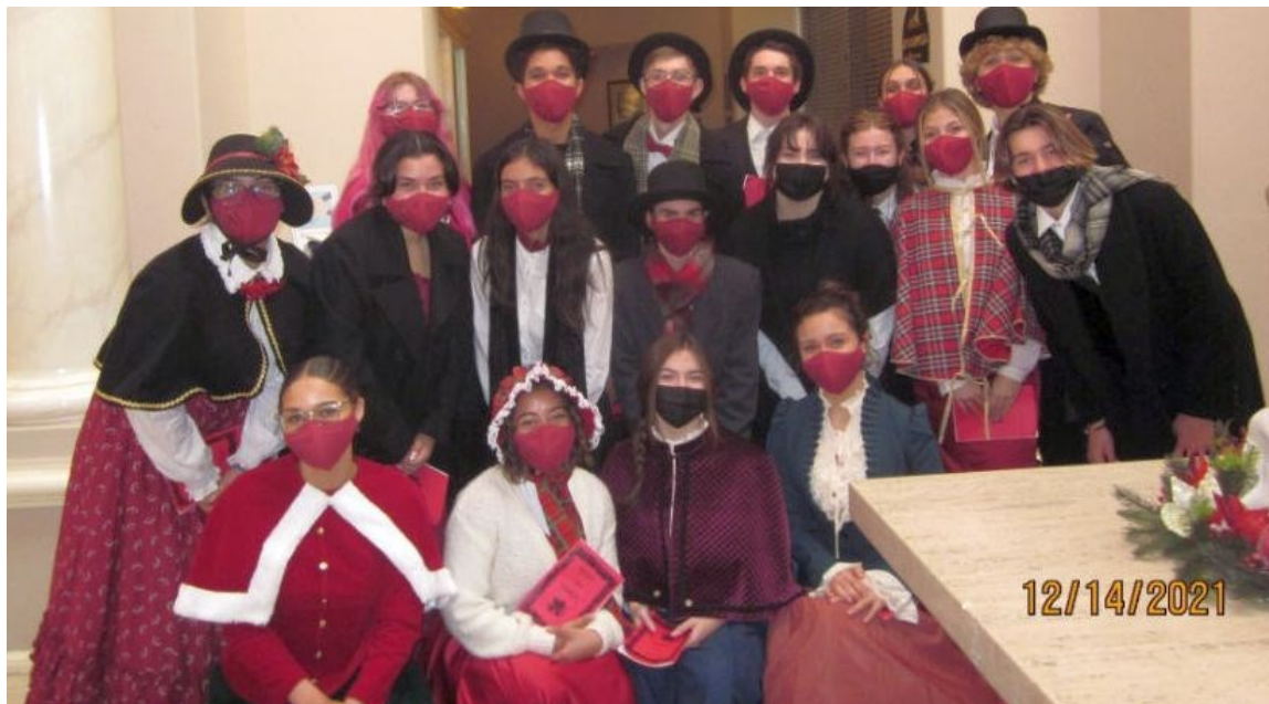
Liberty High School Choir Carolers

Sang Christmas Carols as we arrived and throughout our social hour prior to lunch