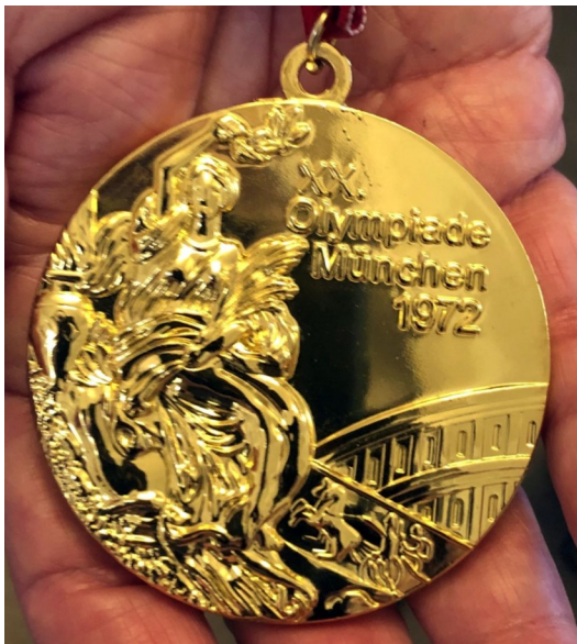
Eddie's gold medal