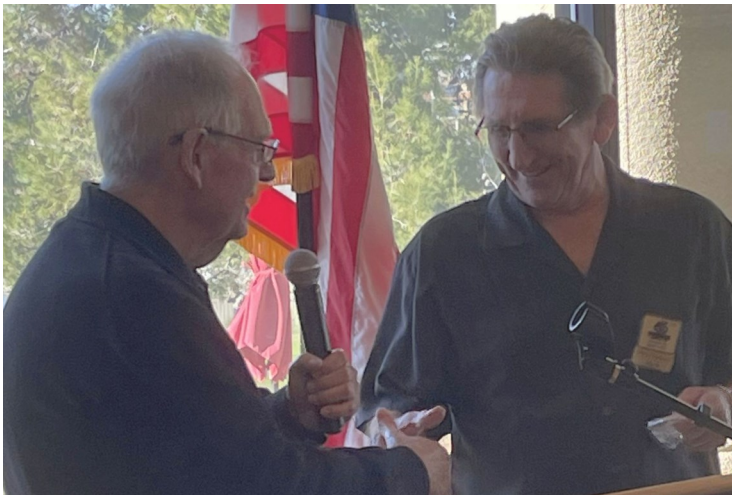
Passing the gavel