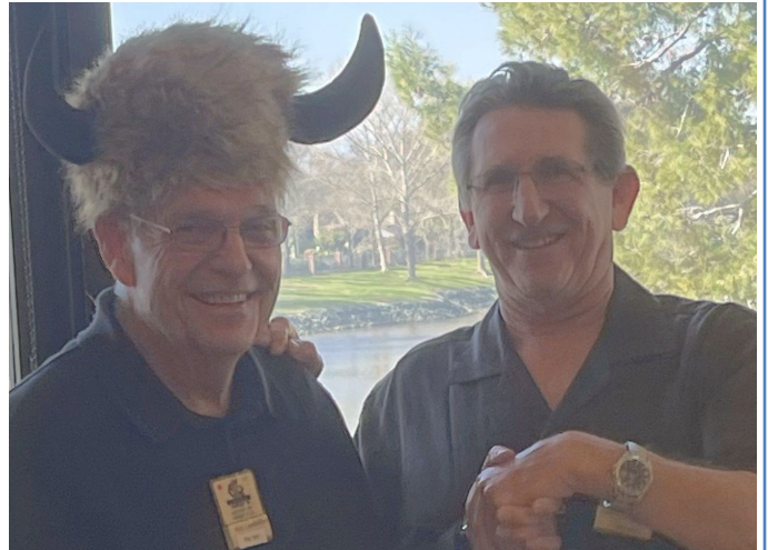
Passing the hat