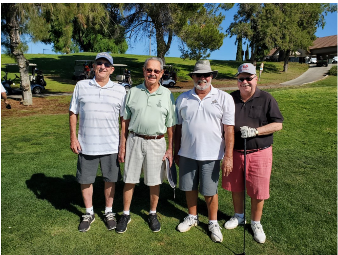
Lone Tree golfers