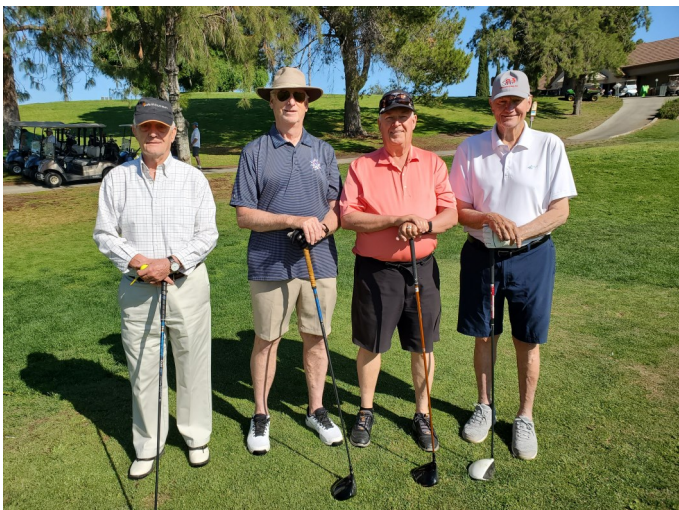
Lone Tree golfers