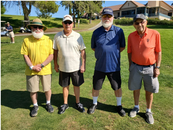
Lone Tree golfers