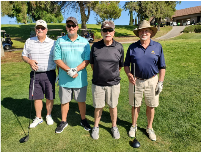
Lone Tree golfers