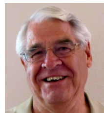
LaVan Bock email distribution