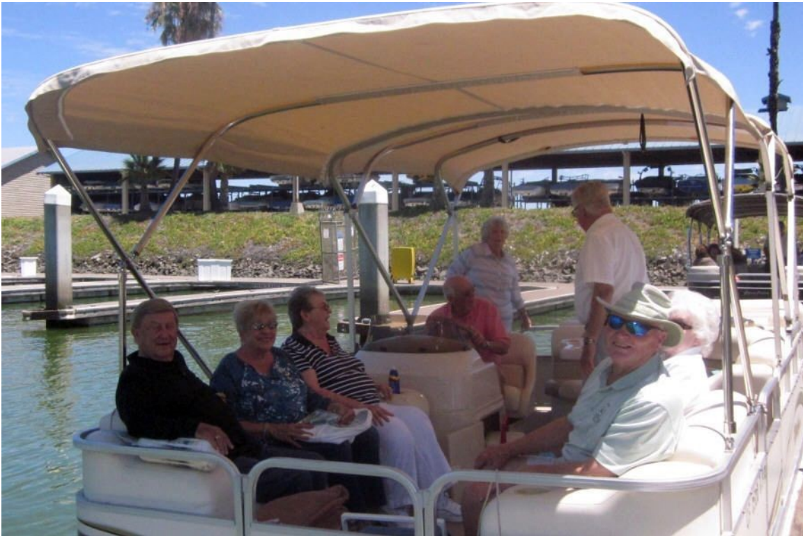
Sirs aboard one of the boats participating in the annual Al DiGiusto Boat Cruise and Luncheon .