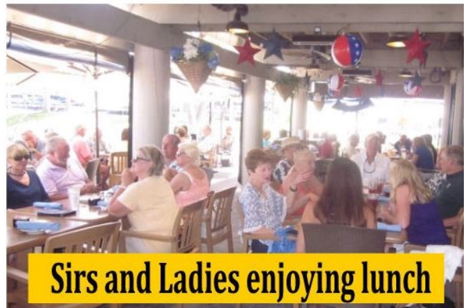
Sirs and Ladies enjoying lunch